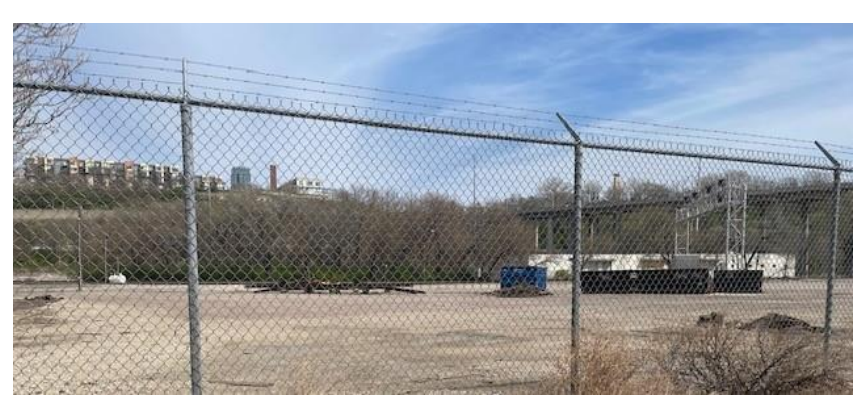
Site of the original Union Station