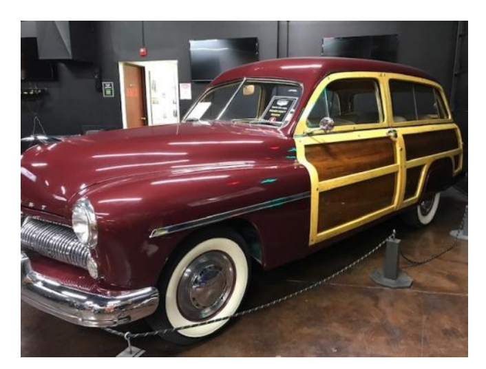
1950 Mercury 3rd seat station wagon