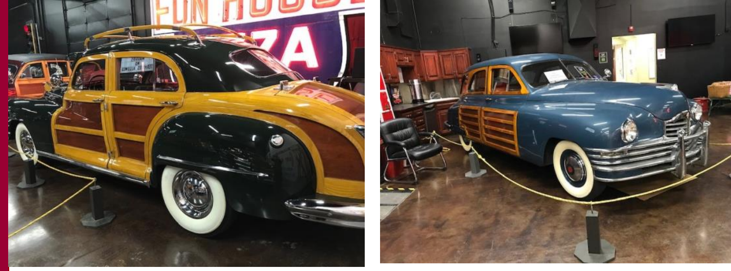
1947 Chrysler Town & Country