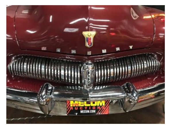
1950 Mercury front end