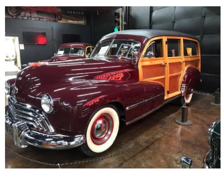
1947 Oldsmobile Deluxe 66 wagon RARE