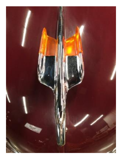
1947 Olds Hood Ornament