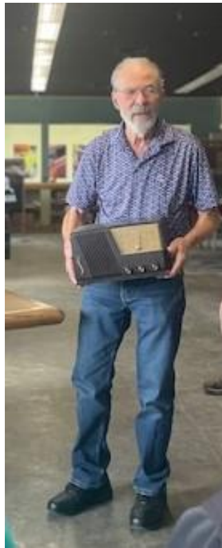
1951 Silvertone radio