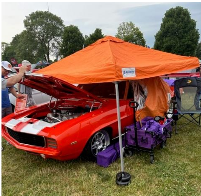
Now this guy really loves his car

So... here are a couple of photos of how our day, or actually our morning, ended.