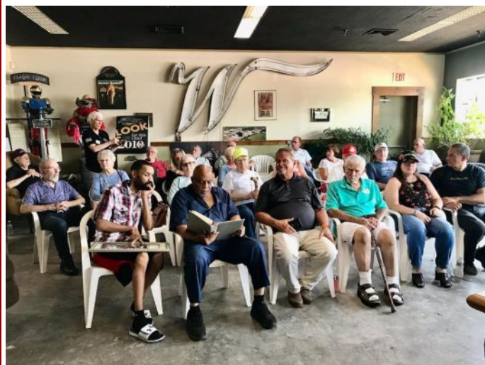
Members getting ready for "Show & Tell"

We had historians, radio repairman, a hand grenade, miniature models of antique cars, big boy toys, a hat signed by Hollywood actors, antique football equipment, WWII whistle and did you know there was such a thing as a kerosene branding iron? Enjoy the photos!