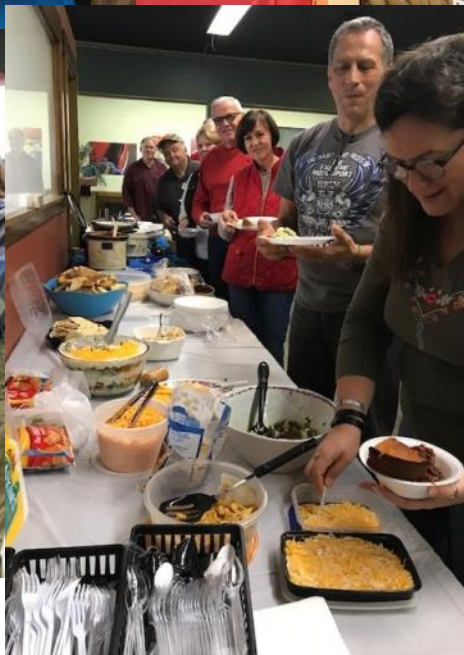
Lining up to eat