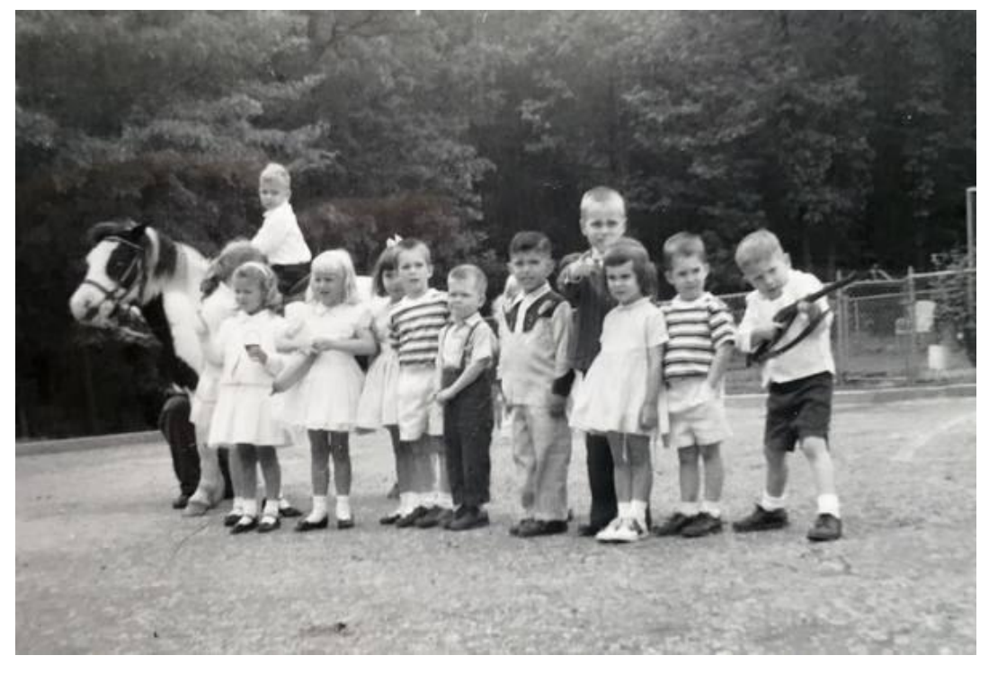
We got dressed up for birthday parties. Even the pony was there!