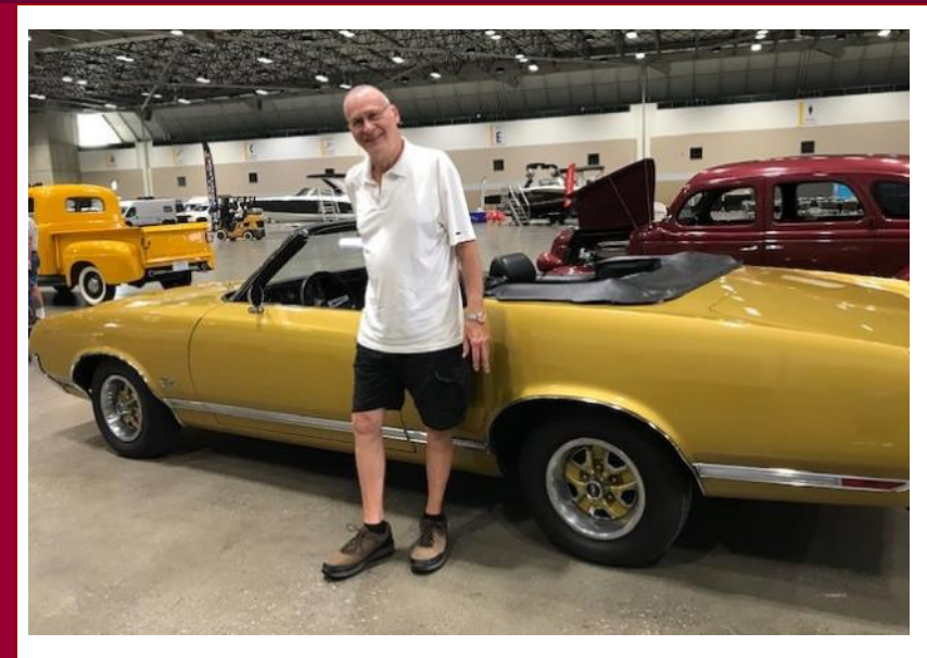
Tom Zeeff 1971 Oldsmobile Cutlass Convertible