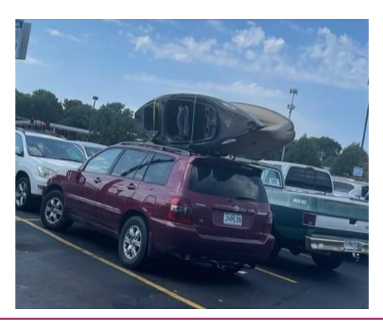
Trivia Challenge Answered