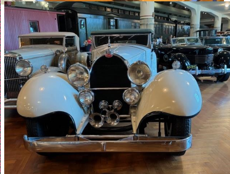
1931 Bugatti Type 41 Royale Only six Royales were built. Cost new was $41,000.