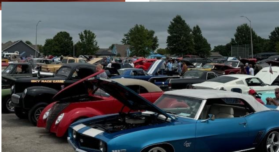
Story : Toni Hall