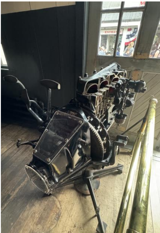
Model T engine