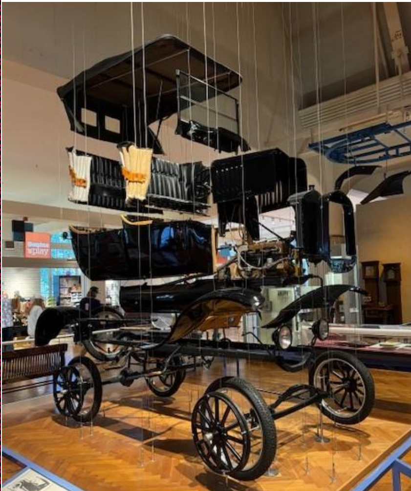
“Exploded” Model T