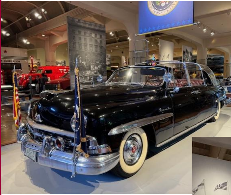
President Eisenhower's Bubbletop car also used by Truman. (1950 Lincoln)