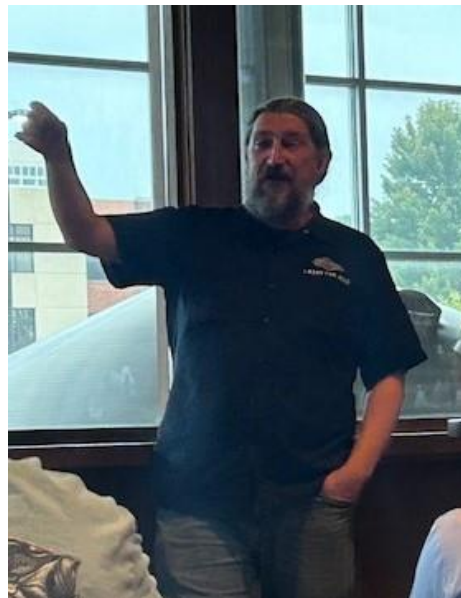
Another tour guide