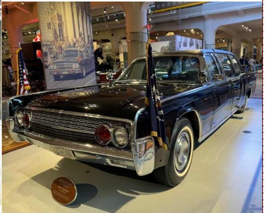
President Kennedy's car which was rebuilt with protective features after his assassination and used by Presidents Johnson and Nixon. (1961 Lincoln)