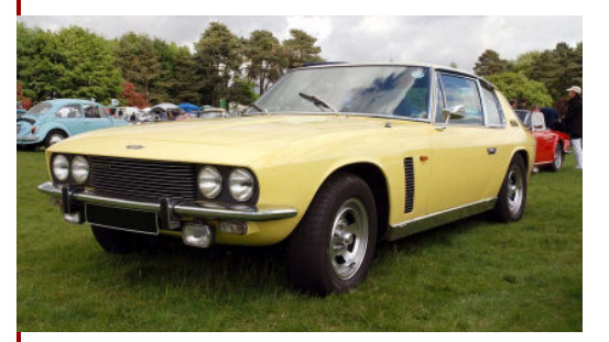
1950 to 1957. What is it?