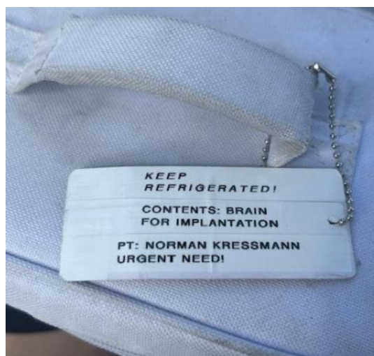
Norm is so fun! What a gag!