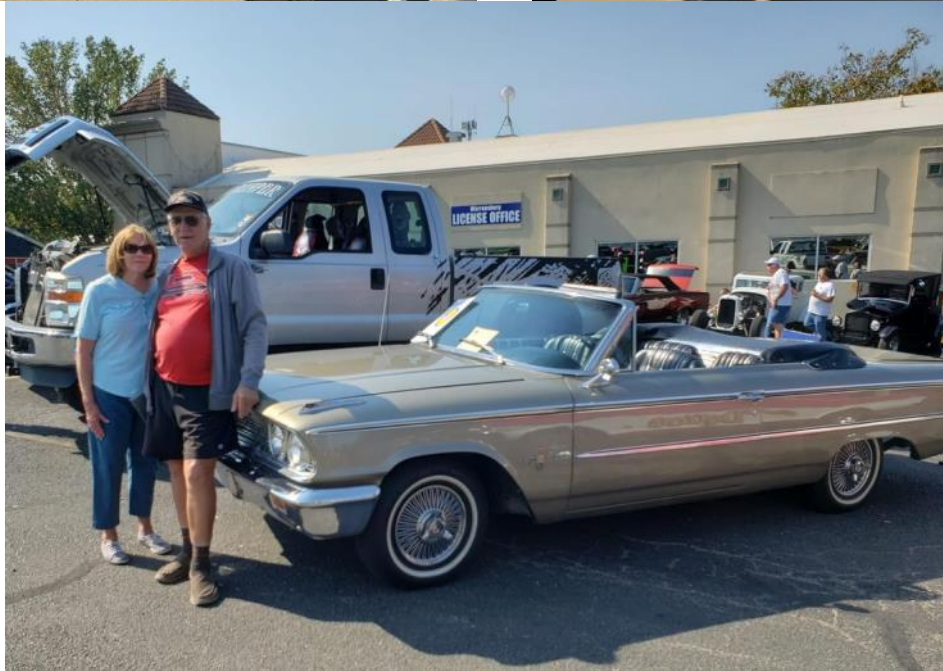
Story: Toni Hall