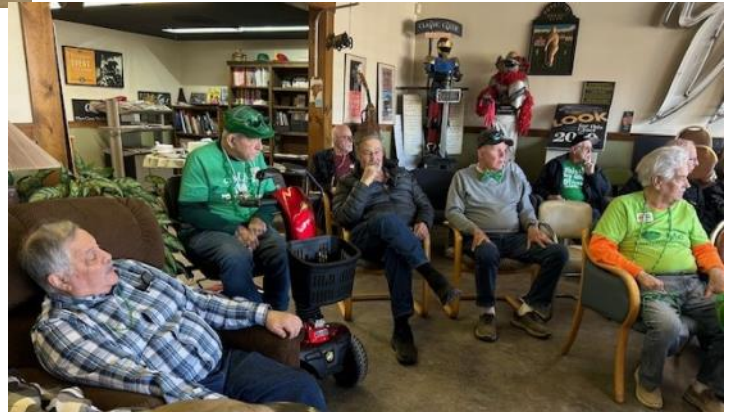
Members taking in club information