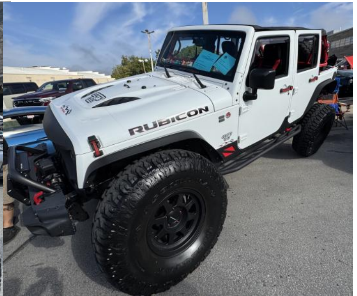
Jeep Rangler Rubicon