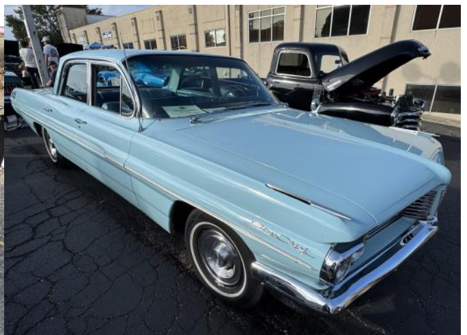
1962 Pontiac Starchief