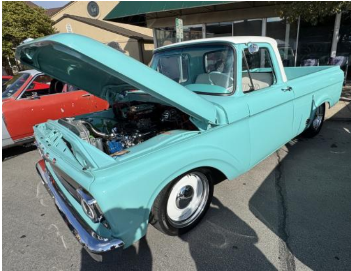
Ford 150 Unibody