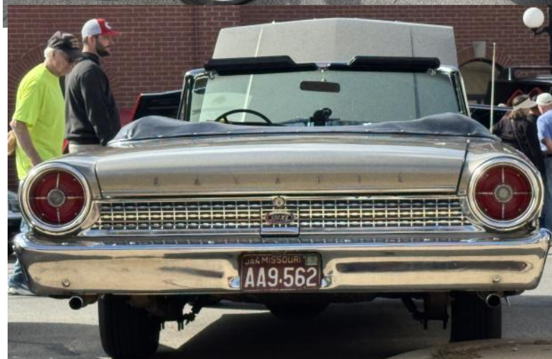
Fred & Toni Hall, 1963 Ford Galaxie 500 XL