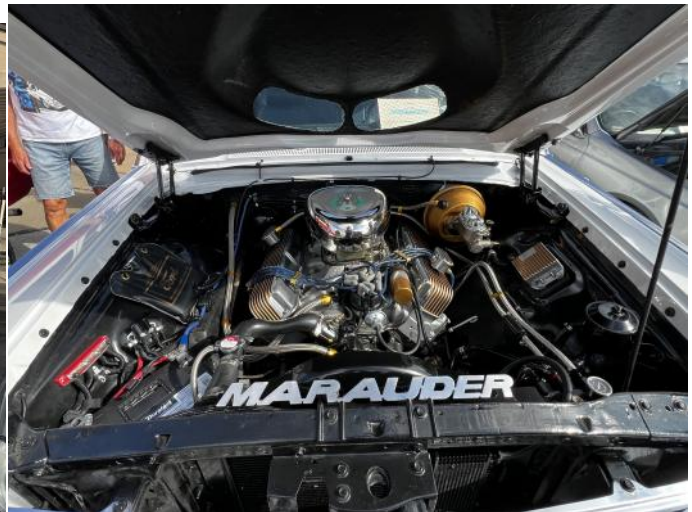
1964 Mercury Park Land Marauder