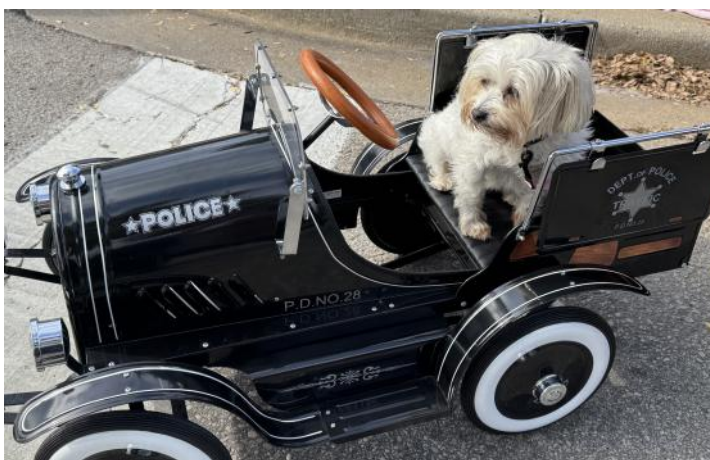
Just too cute!