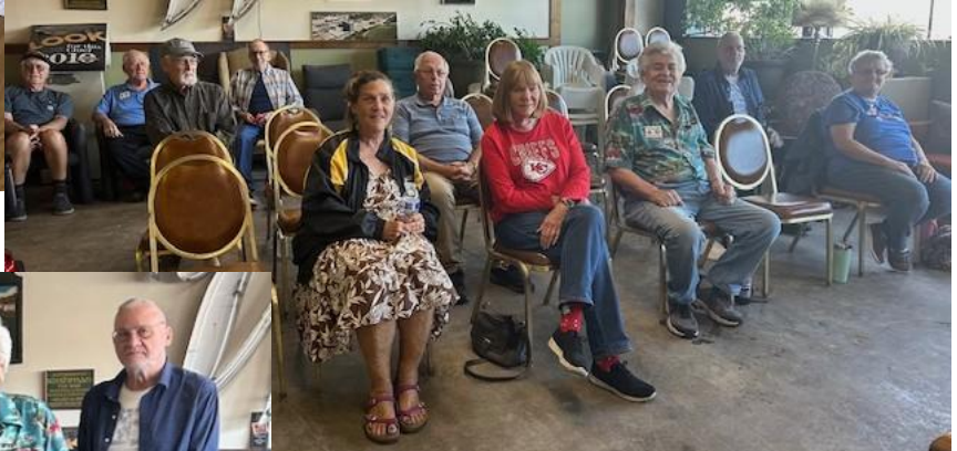
Our club members