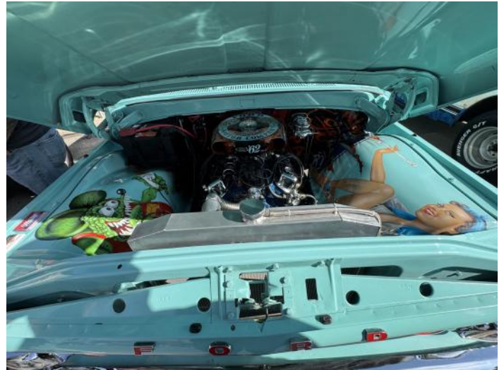
The custom air cleaner is a bed pan