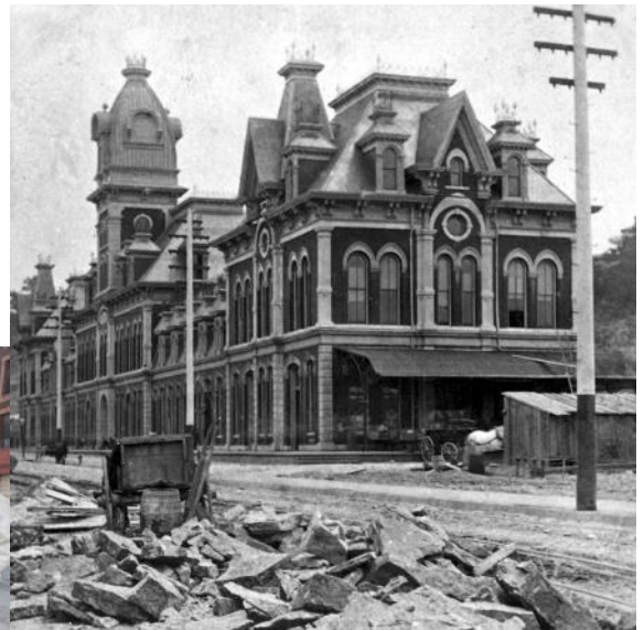
The original Union Station was quite a beautiful building.

Construction of a new station at Pershing and Main began in 1906 and was opened October 30, 1914.