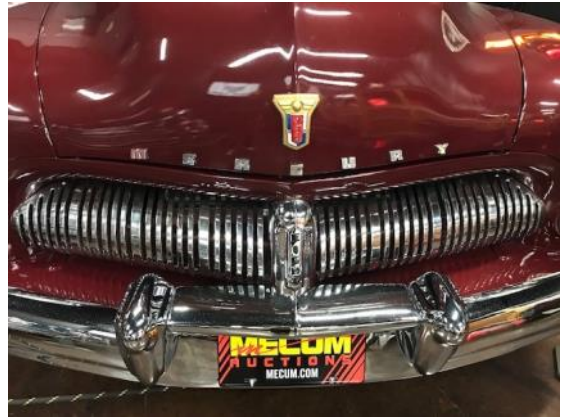
1950 Mercury front end