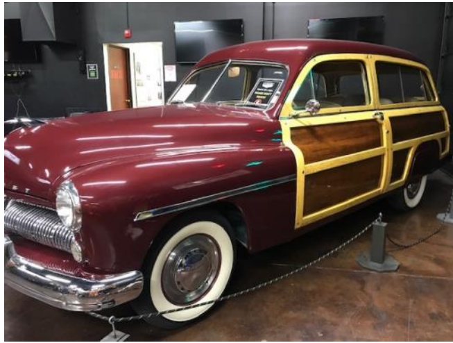
1950 Mercury 3rd seat station wagon