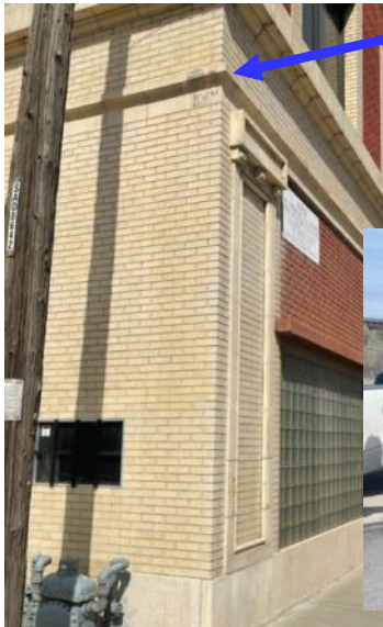
Roscoe points out the building corner etching reads 1951 HWM. The remainder of the 1951 Flood's High Water Mark.

The last train to leave the old station was October 31, 1914. The building was razed in 1915 and is now an empty lot.