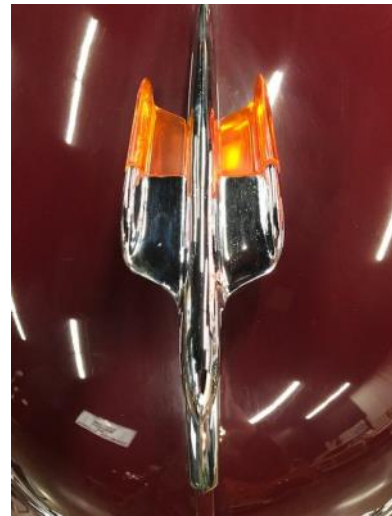
1947 Olds Hood Ornament