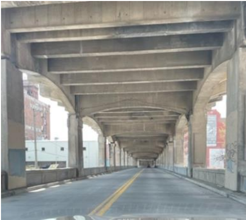
Viaduct to the West Bottoms. Just too cool!