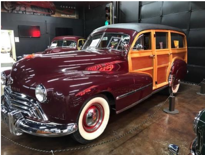
1947 Oldsmobile Deluxe 66 wagon RARE