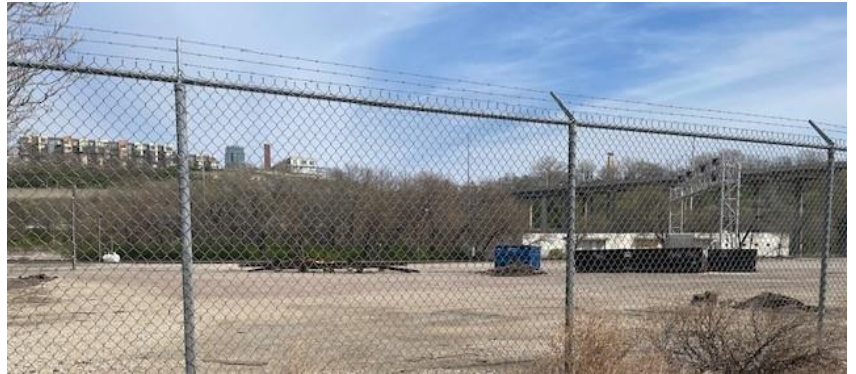
Site of the original Union Station

The West Bottoms was the site of the original Union Station. After a smaller depot burned, the new Union Station was built in 1878 at Union Avenue and Santa Fe Street at a cost of $410,028. It was the largest building west of New York. It served the need of transporting passengers and merchandise to the West, due to the construction of the Hannibal Bridge, the first over the Missouri River. It was expanded in 1880 for $224,083. The flood of 1903 severely damaged the station raising the concern for a new station.