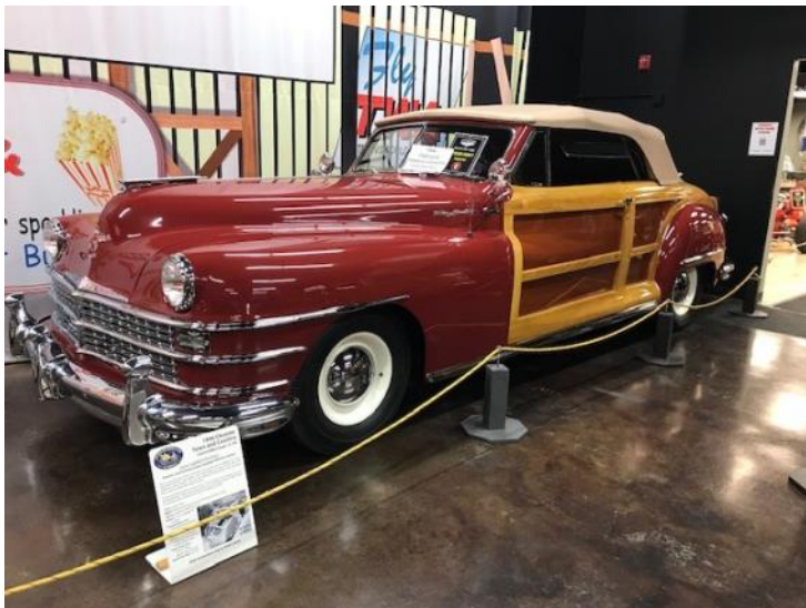
1946 Chrysler Town & Country Convertible