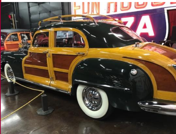
1947 Chrysler Town & Country