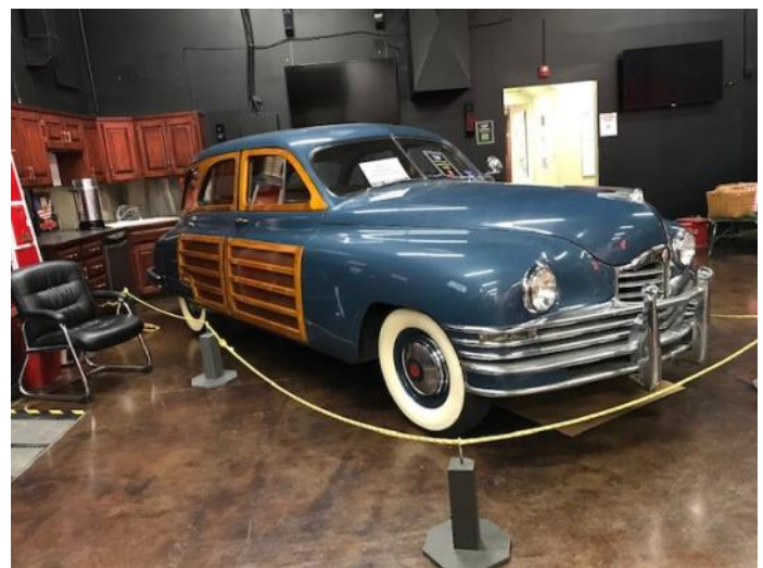
1948 Packard Sedan Station wagon