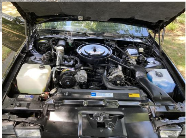
What a clean engine