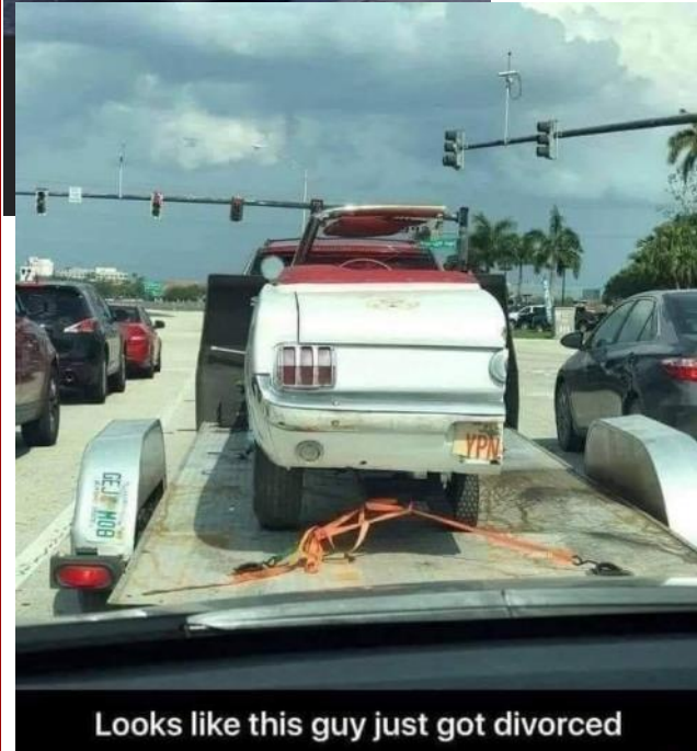
Looks like this guy just got divorced