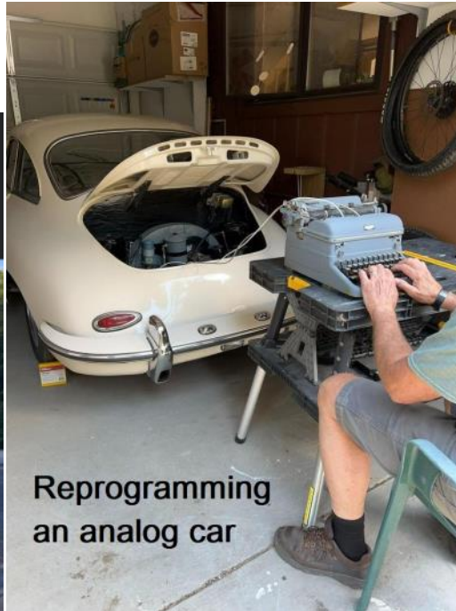
Reprogramming an analog car