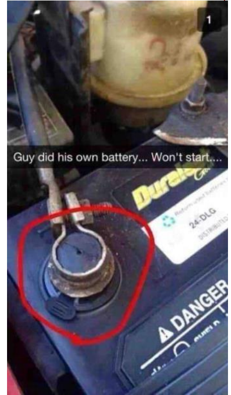
Guy did his own battery... Won't start....