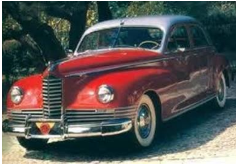
1947 Packard line

What was the first car to use power operated seats?