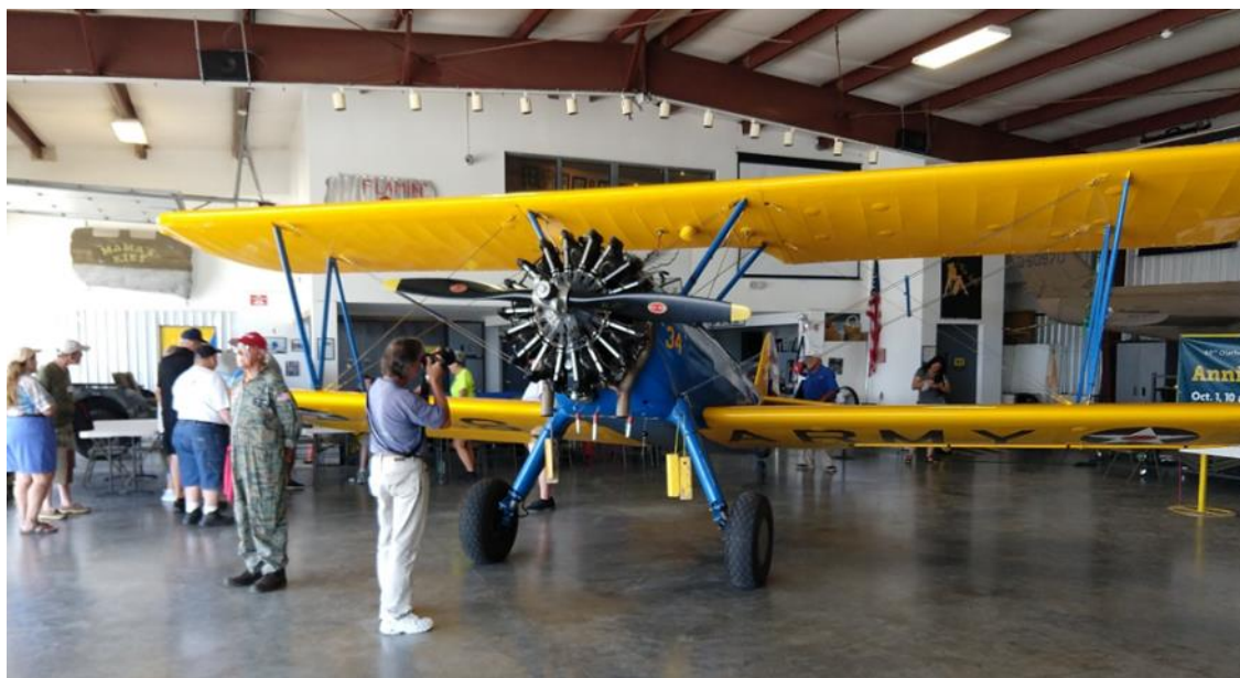
1940 Stearman PT-13A

The CAF is a commemorative organization with the intent to preserve the history of US military aircraft. Much like individuals in our club, local CAF chapters, or Wings, own, restore and show these aircraft. The Heart of America Wing of the CAF owns several examples including a 1940 Stearman PT-13A “Kaydet” trainer and a 1943 Fairchild PT-19A (currently under restoration). The hanger also houses aircraft from other local preservation clubs including a Vietnam era Bell UH-1 Iroquois “Huey” Helicopter.