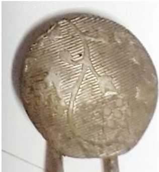
Pin head detail