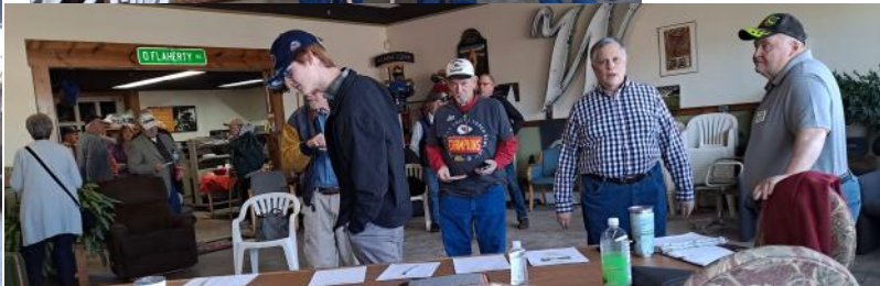
Always fun to see everyone!

Story: Bonnie Johnson