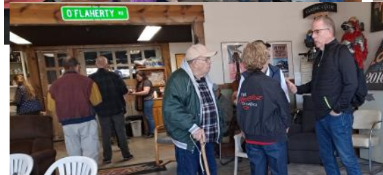
Members catching up!