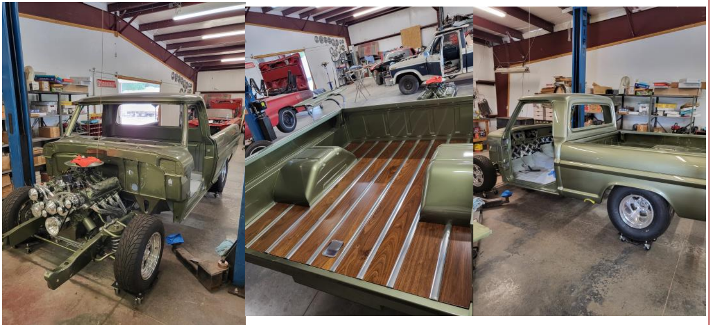
1968 F100. Walnut bed wood final fit. Cab and bed back on frame ready for wiring and plumbing.