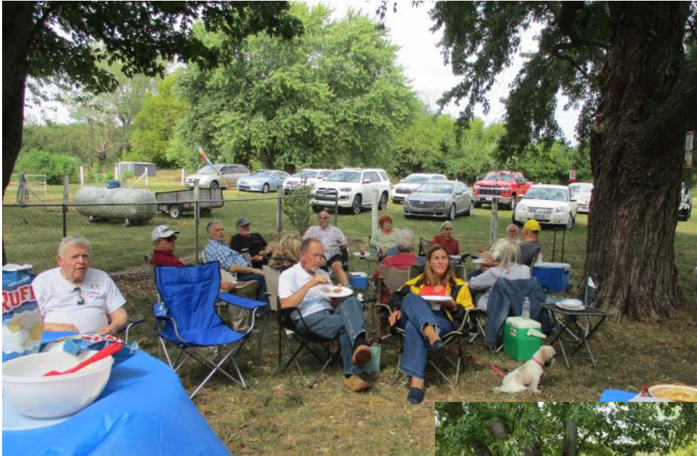
Club members enjoying food and conversation